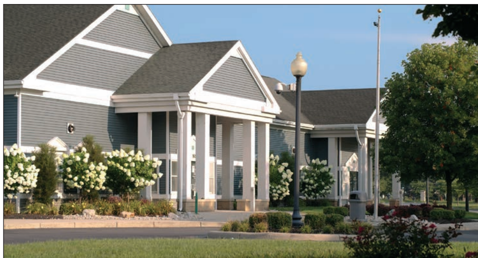
Cassano Health Center at 165 South Edwin C. Moses Boulevard.

Cassano is staffed by Grandview Hospital (Kettering Health Dayton) resident physicians and attending faculty and has been a hub for residency training since opening in 2003. Nearly all of Grandview's DO graduates have rotated through this training clinic, which provides an exceptional learning and life experience for resident physicians.