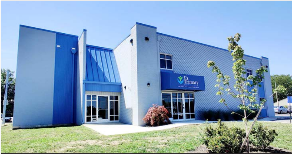
Primary Health Solutions Grafton facility.

Emergency Department was doubled in size to meet community need when Good Samaritan Hospital closed. Grandview's Cassano Health Center was already at capacity and not able to take new patients, so a new primary care site was needed to provide follow up care for patients after emergency visits. The temporary location will be tight and challenging – but the end reward will be worth the inconvenience.